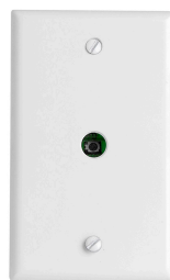
*IR Eye available for Spectra i.Net & n.FORM