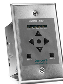
*keypad available for Spectra i.Net Only