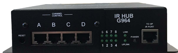
Spectra i.Net IR Hub