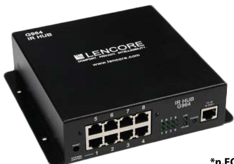
*n.FORM Hub shown. Spectra i.Net IR Hub has 4 channels

When installing more than one IR Keypad to an OP, use the IR Hub as shown below. Two different models are available for Spectra i.Net and n.FORM.