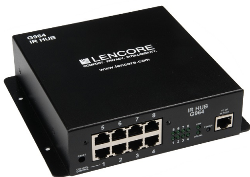
n.FORM IR Hub

The IR Hub is an additional component that allows for more than one keypad or wallplate to be installed in an OP IR port allowing individual OP channel volume adjustments for masking, music and paging. Up to four keypads or wallplates for Spectra i.Net and up to eight keypads for n.FORM may be installed in each hub allowing each OP channel to be adjusted by an individual keypad or wallplate.